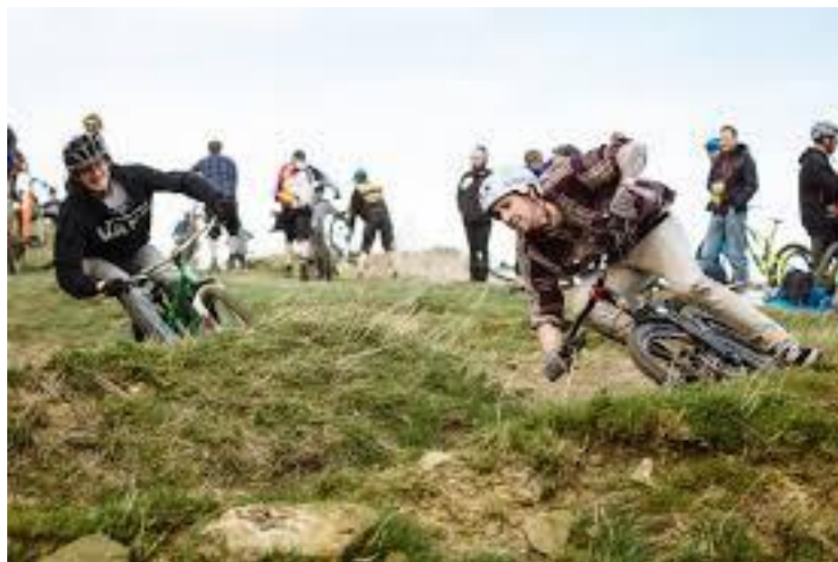
Internet picture for attention

Clun open day for 1 November and we have an awesome day of fun lined up.