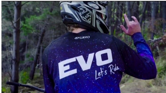
Cheers EVO- until next time.

It was a bit wet the day before and a little greasy the morning off, but it was all smiles.