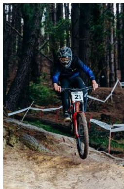
Yeah Boi!! Fastest on the day