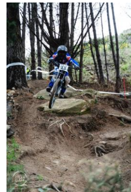
Snazzy line in the R/Garden